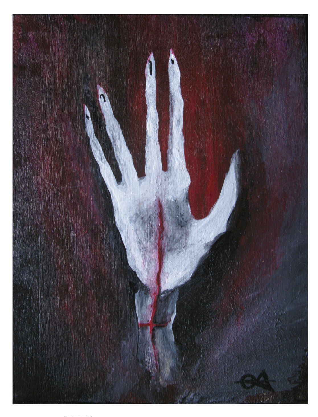
"INRI" by Orlee Andromedae, www.motherofabominations.com