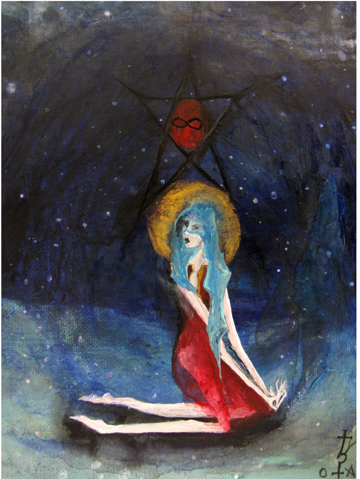
LOVE SONGS OF RAPTURE by Orlee Andromedae, www.motherofabominations.com