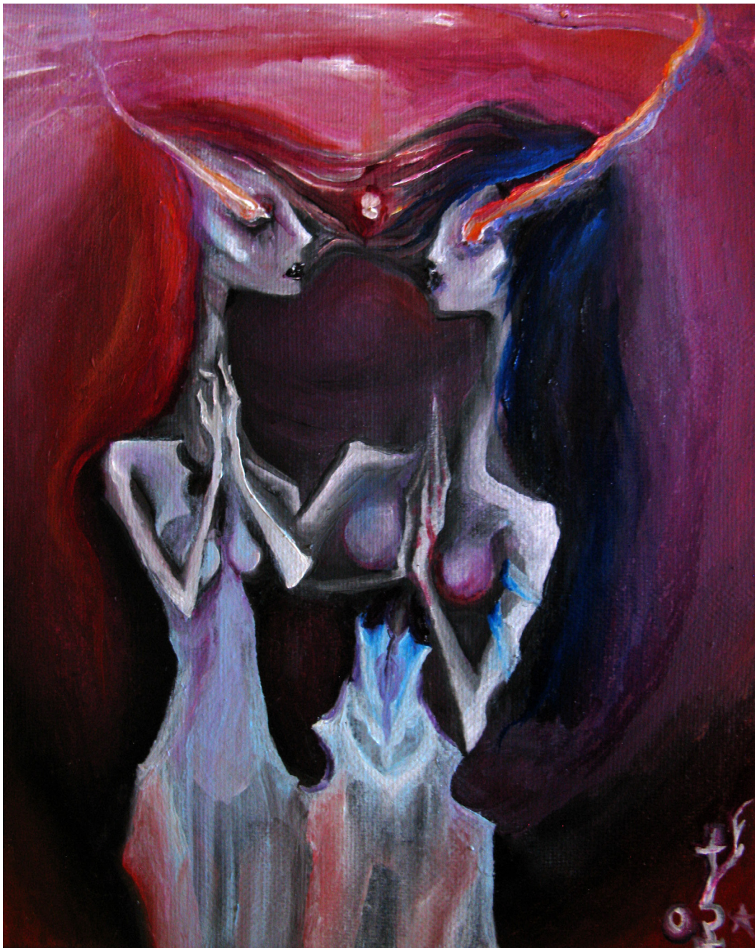
DAUGHTERS OF FORTITUDE by Orlee Andromedae, www.motherofabominations.com