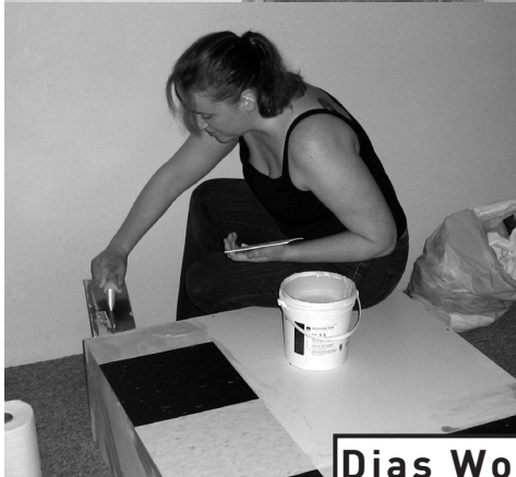
Dias Work Party in Action!