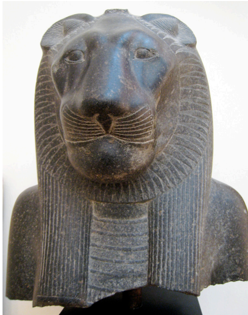
BUST OF SEKHMET GRANITE STATUE 1403-1365 BC

Sekhmet and Anpu (Anubis) were great helpers of the deceased; at the judgment it is essential that the deceased speak the necessary words of power and if the deceased's mouth is righteous and true they are immediately granted