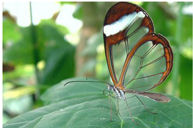
Above: Butterfly of genus Greta oto with transparent wings

Meanwhile, Horizon members are continuing to hold events in private homes, much in the fashion of the Victorian occultists who are the subject of some of the writing in this publication. Information about Horizon events is available at the web site http://seattle-oto.org .