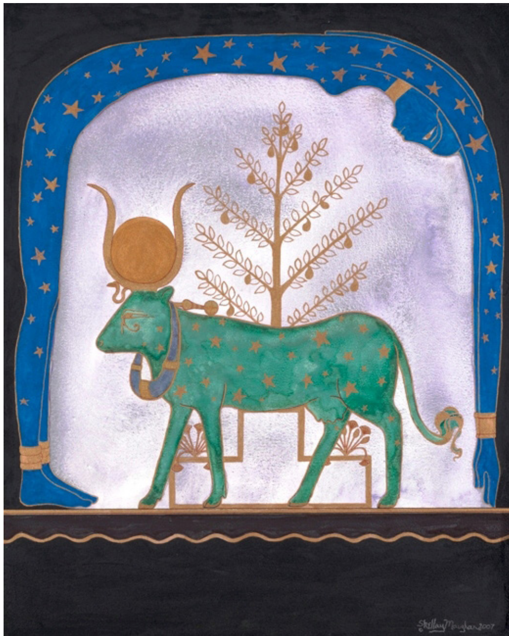
Our Lady of the Sycamore ~ Stele of Night by SISTER SHELLAY MAUGHAN